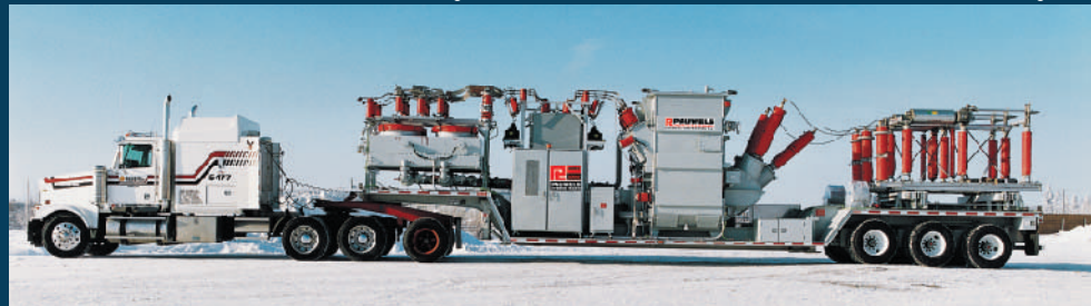
Mobile substation 20 MVA, 115-67 kV/13.2-26.4 kV 95°C winding rise