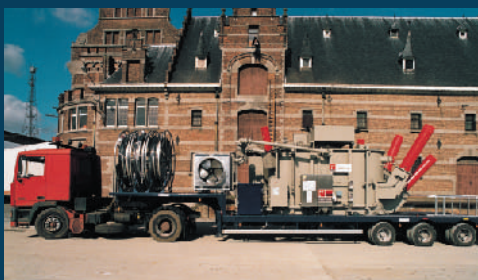
Mobile substation 15 MVA, 132-66 kV/21-15.75 kV 95°C winding rise