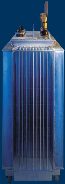
2 MVA SLIM ® Transformer